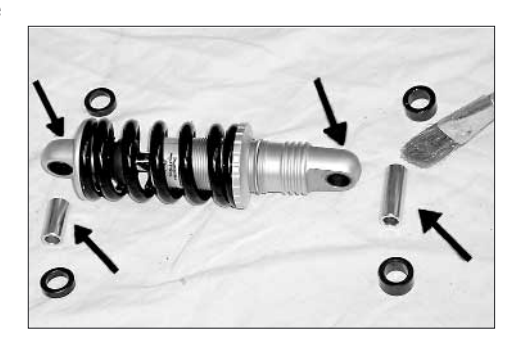
The bushings of the rear spring element need to be lubricated once a year.

Remove the plastic spacers and pull the metal tube out off the bushing. Lubricate the bushing and the tubes with grease. Finally remount the suspension element.